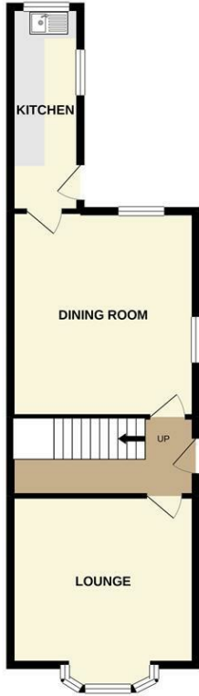
GROUND FLOOR 518 sq.ft. (48.1 sq.m.) approx.